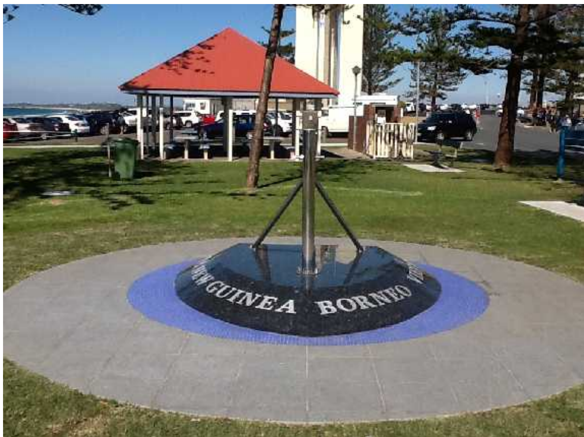
The 32 Memorial at Point Danger, Coolangatta. The white structure in the background is the Point Danger Light which is also the border of New South Wales and Queensland.