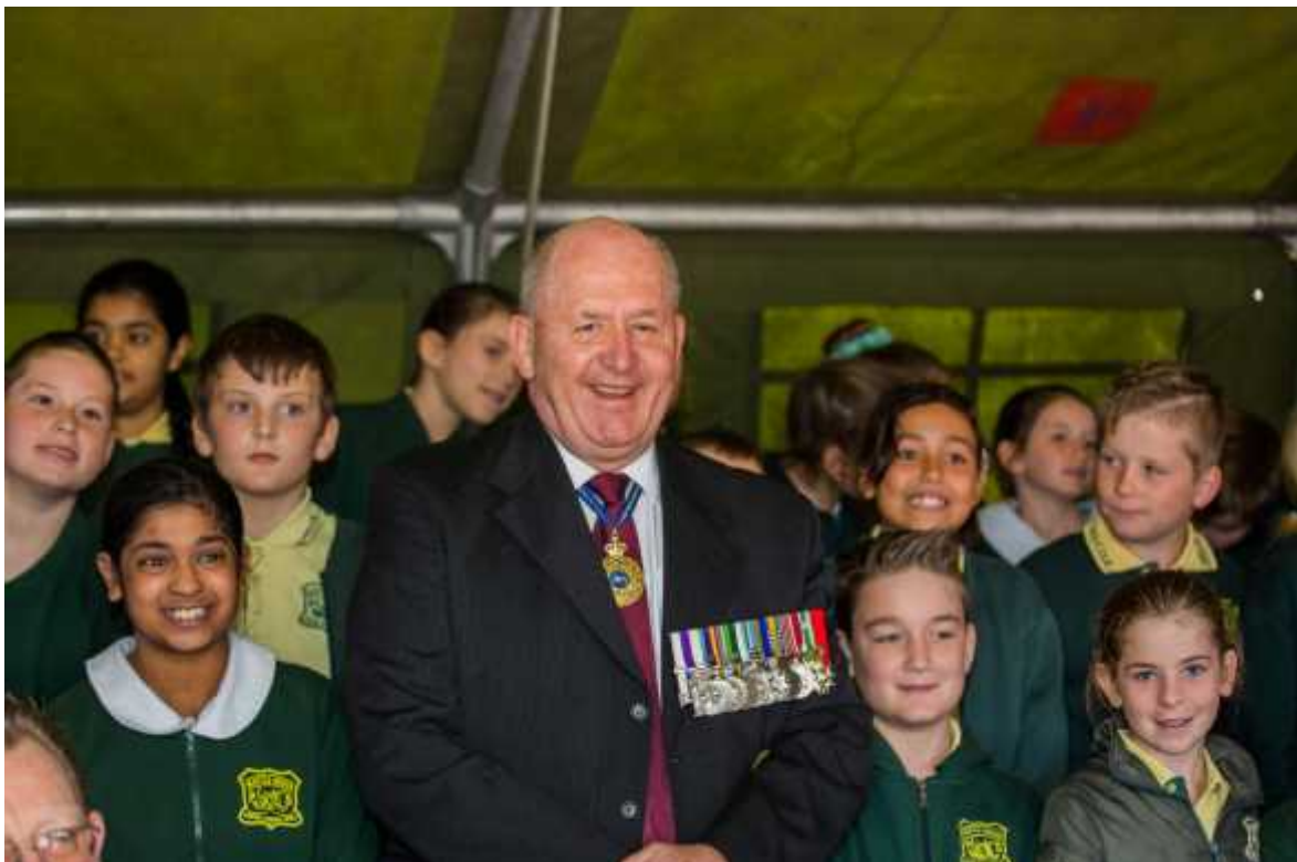
The Governor General with the choir of Wattle Grove Public School