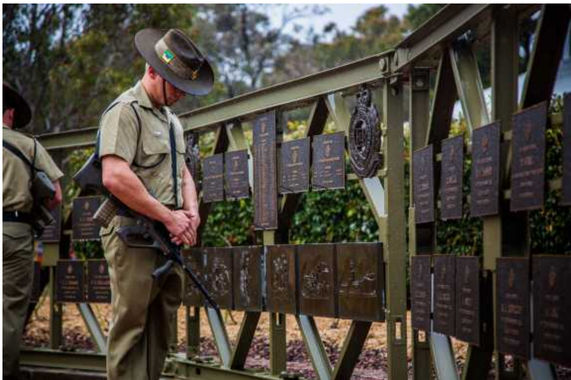
A wet sapper of the Catafalque Party at the RAE Vietnam Memorial