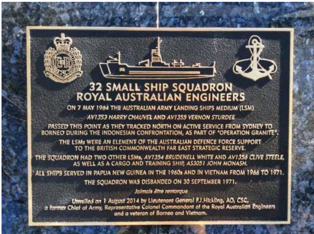
The bronze plaque at the rear of the memorial